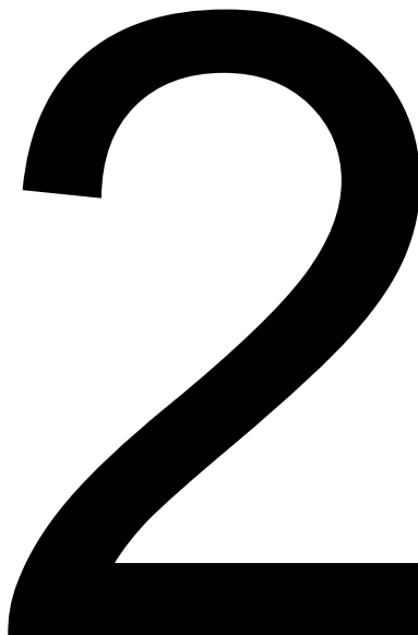
OPERATION - CLEAR VIEW

Property owners are responsible for the care and maintenance of trees, plants, and grass on private property.