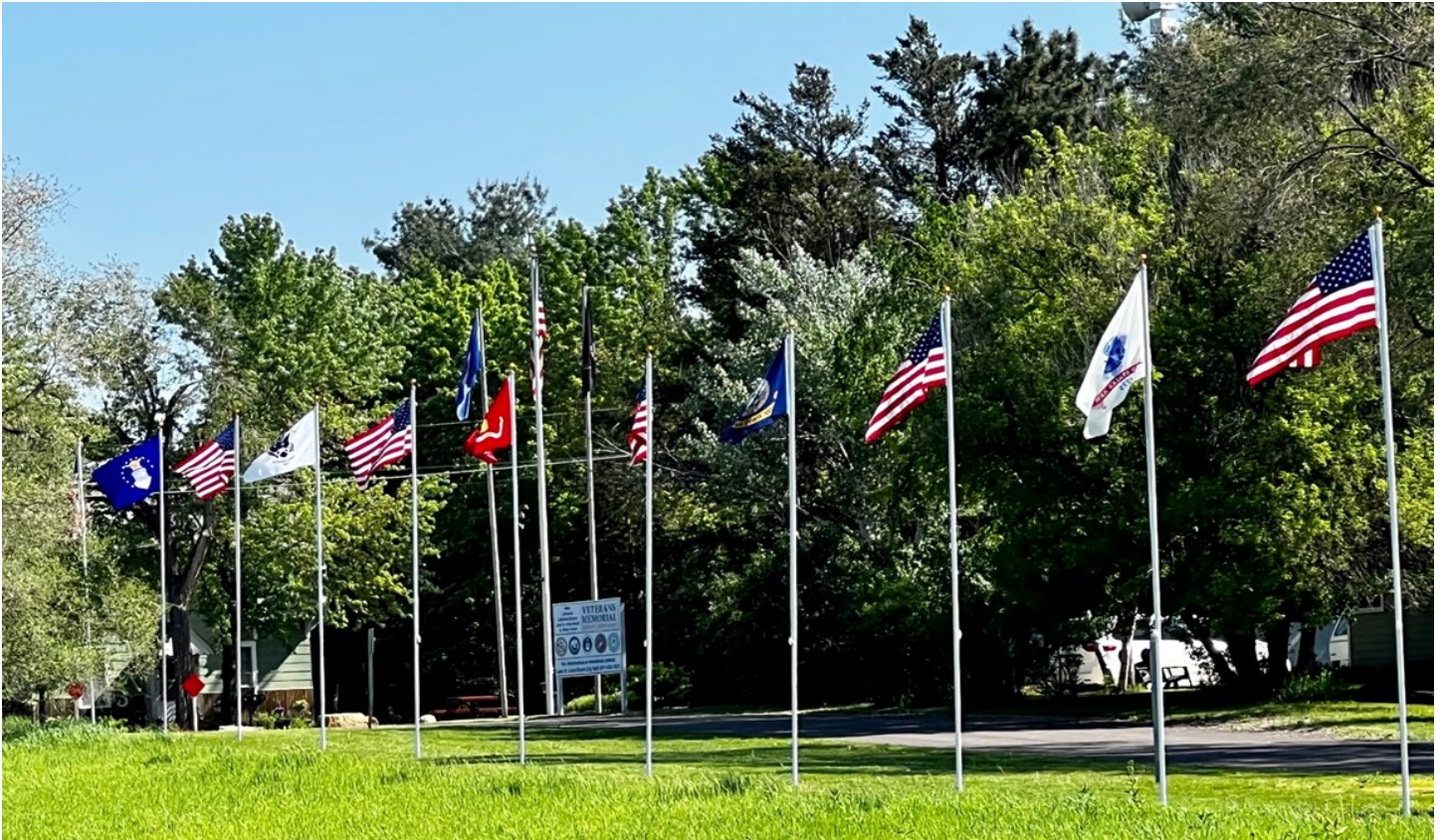
Lower St. Croix Valley Veterans Memorial Park