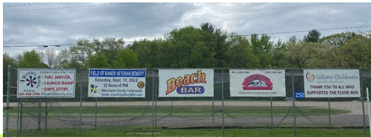
Pettitt Park 2022

LAKE ST. CROIX BEACH POSTAL PATRON ROUTE 1