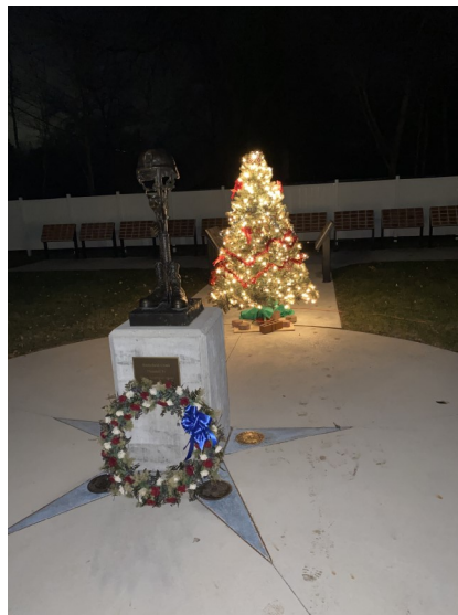
Veteran's Memorial 2020

Thank you for keeping LSCB streets safe!