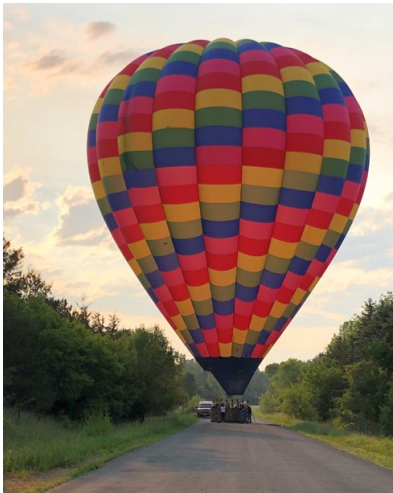
Photo of balloon landing on LSCB City Street

Phone: 651-436-7031 Fax: 651-483-8310 Email: lscb@comcast.net